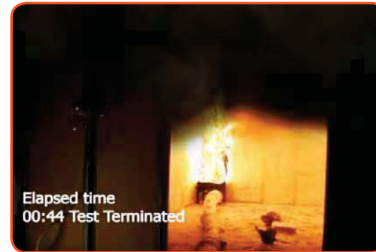
Exposed Closed Cell Foam

Foam insulation systems are developed from plastic polystyrenes, polyurethanes, and polyisocyanurates. If foam is left exposed on the interior of a building, it can create a life threatening possibility in the event of a fire.